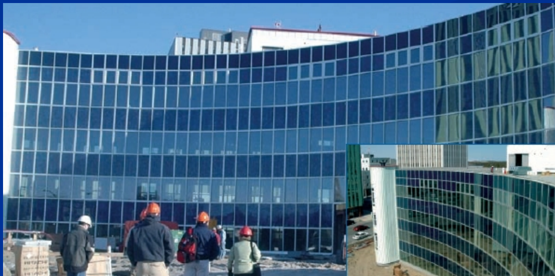
First LEED Building North of 60